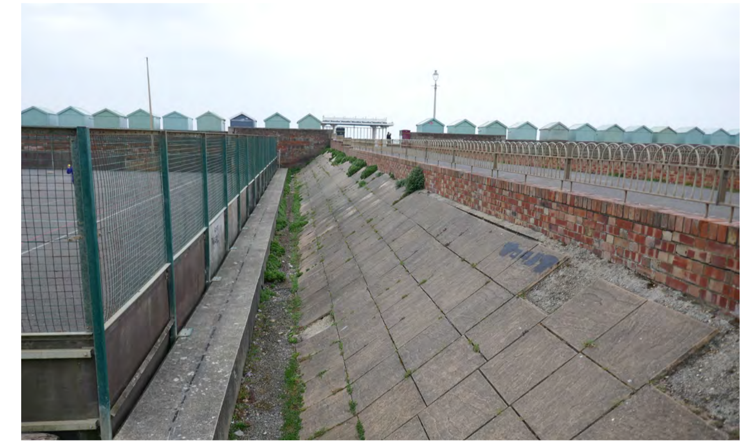
Existing MUGA facility contributes to inaccessibility of the site