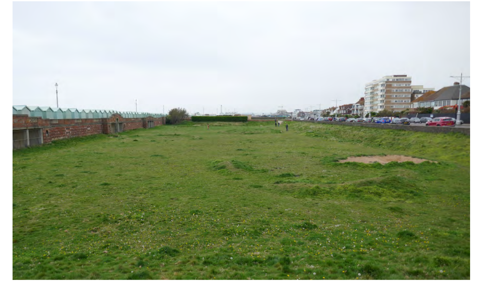
Existing bare amenity lawn of old Pitch & Putt space