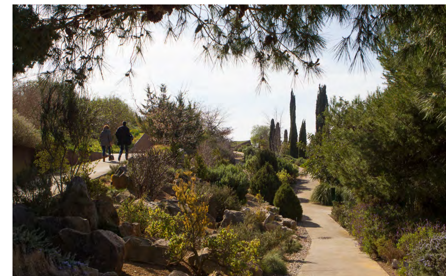
Planted embankment precedent (Botanic Gardens, Barcelona)