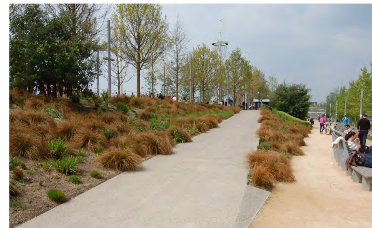
Planted embankment precedent (Queen Elizabeth Olympic Park, London)