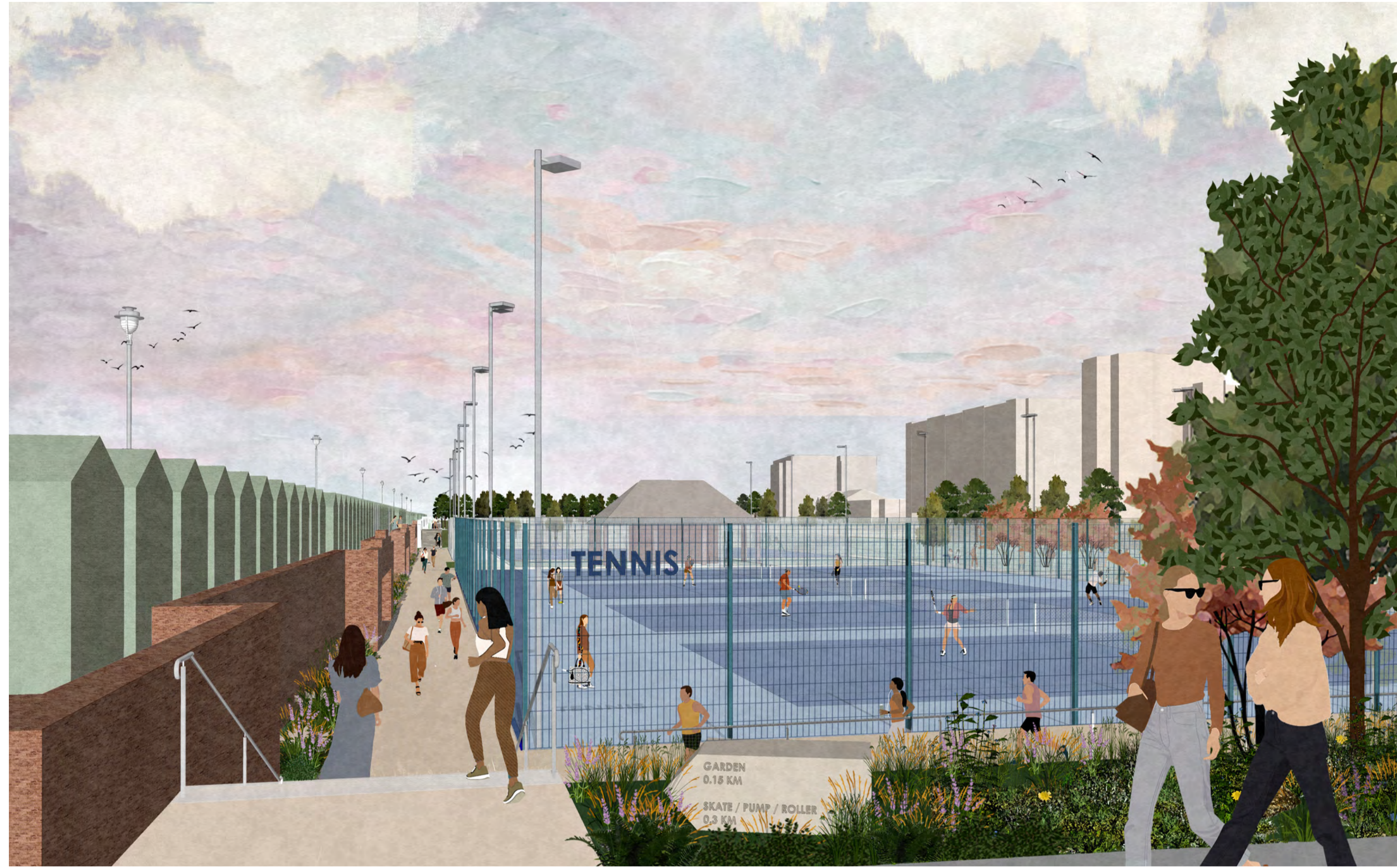
Artist's impression, view from east showing new Tennis Courts and the new accessible route through the Linear Park