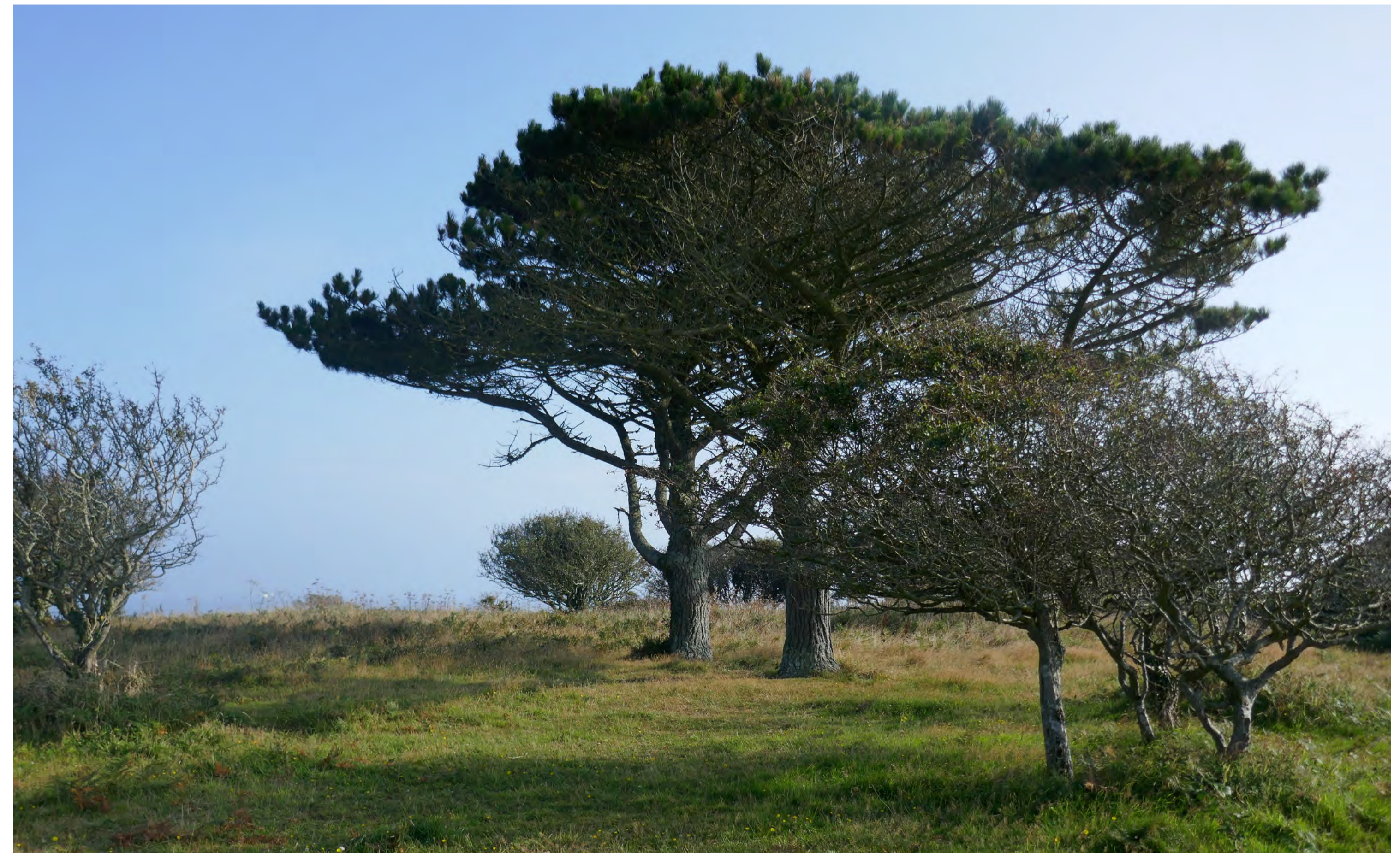
Coastal pine and hawthorn, demonstrating character of planting shaped by the wind (Dodman Point, Cornwall)